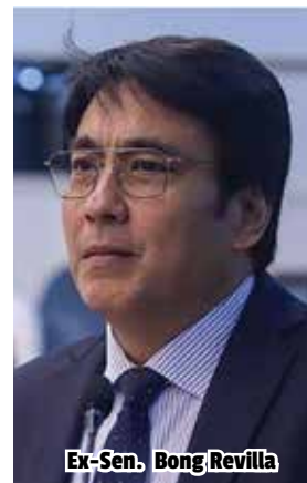
Ex-Sen. Bong Revilla

"Ang alaala niya ang pinakamahalagang yaman namin," said Jolo, as he affirmed that the fam-