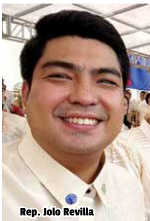
Rep. Jolo Revilla

Agimat partylist Representative Bryan Revilla said that the clan will continue to honor and remember his Lolo Ramon's legacy as a film legend and public servant and his important role as a patriarch of the Revilla family./ET II