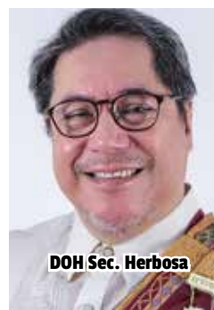
DOH Sec. Herbosa

ospital, botika, at lokal na pamahalaan.