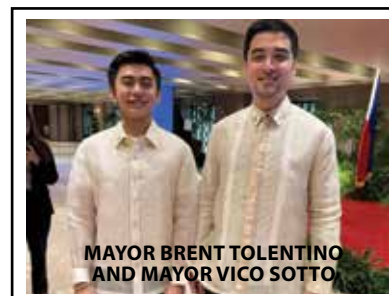
MAYOR BRENT TOLENTINO AND MAYOR VICO SOTTO

Mayor Brent Tolentino and Mayor Vico Sotto champion progressive governance