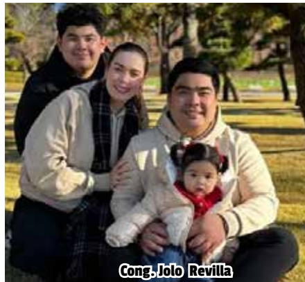
Cong. Jolo Revilla

Wika niya: "Masaya po kami na naipagdiwang ng aming mga magulang ang kanilang espesyal na araw. Sa kabila ng mga pagsubok, nananatili ang pagmamahalan nila at iyon