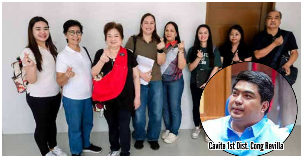
Cavite 1st Dist. Cong Revilla