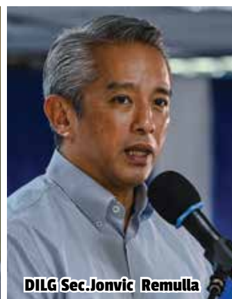
DILG Sec. Jonvic Remulla

sabi ng France, at ang Colombia, nanawagan