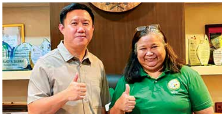
MULA sa dating P150, gagawin nang P200 ang badyet sa pagkain ng

"Ito po ay isang simpleng paraan ng pasasalamat