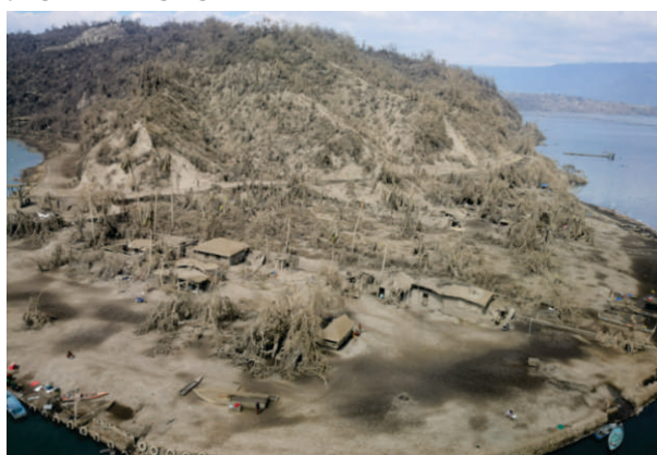
Natabunan ng ashfall ang pamayanang ito ng Bayan ng Agoncillo, Batangas

Sa gitna ng kanyang lideratong patuloy na humahakbang sa hagdanang ng kaunlaran, sinubok ang bayan ng isang trahedyang nagmistulang bangungot sa bawat isang Agoncilliano, ang pagputok ng Bulkang Taal noong 2020. Ang mga residente ng Agoncillo ay nakaranas ng matinding ashfall at mga lindol mula sa Bulkang Taal. Ang mga lindol ay nagdulot ng mga bitak sa mga kalsada at mga bahay, na nagpalala sa sitwasyon ng mga residente. Ang mga kabuhayan sa Agoncillo, tulad ng pangangisda at pagsasaka, ay labis na naapektuhan. Ang Taal Lake, na pangunahing pinagkukunan ng kabuhayan ng mga residente, ay naapektuhan ng ashfall, na nagdulot ng pagkamatay ng mga isda at pagkawala ng kabuhayan. Malaking pagsubok sa buong bayan ngunit hindi natinag ang Lokal na Pamahalaan upang tugunan ang pangangailangan ng bawat isa. Mabilis na nakaahon ang bayan ng Agoncillo at maging ibang bayan ay humanga sa kahusayan ng mga naglilingkod sa pagpapanumbalik ng ganda at pag-unlad ng Agoncillo.