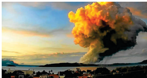
Nang pumutok ang Taal Volcano noong 2020

Isinulong niya ang turismo sa pamamagitan ng promosyon ng likas na yaman ng Agoncillo, gaya ng Lawa ng Taal at mga eco-tourism spots, na ngayo'y unti-unting dinarayo ng mga turista. Kasama rito ang mga lokal na produkto na isinulong upang makilala at makapagbigay ng dagdag kita sa mga mamamayan.