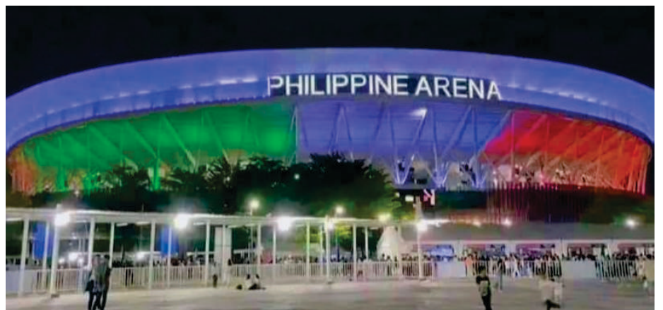
Philippine Arena in Ciudad de Victoria, Bocaue, Bulacan – the venue of NEU's 50th Commencement Exercises, 50th Anniversary Celebration, and Grand Alumni Homecoming on June 20, 2025

The NEU 50th Anniversary Celebration was held in the afternoon of June 20, 2025, at the Philippine Arena.