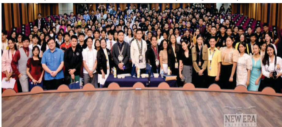
Participants and judges of NEU Debate during the NEU Fair 2025 held from April 21 to 25, 2025, at NEU's main campus in Quezon City

Thrilling activities and heart-stirring performances were held during the NEU Fair 2025 from April 21 to 25, 2025, at NEU's main campus in Quezon City.