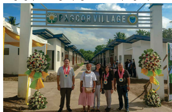
Pabahay para sa mga taga-Agoncillo na apektado ng pagputok ng Taal Volcano. Naipatayo sa tulong ng PAGCOR