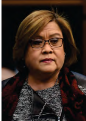
Atty. Leila De Lima