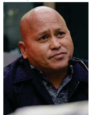
Sen. Bato Dela Rosa

Marcos said, "Nobody's bullying you," referring to Remulla.