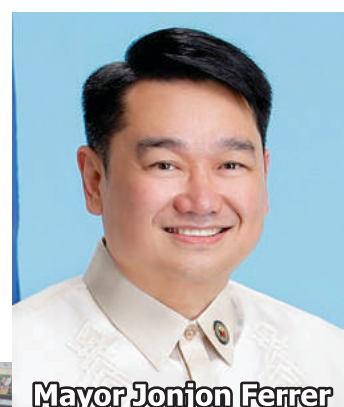
Mayor Jonjon Ferrer