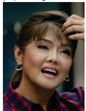
Sen. Imee Marcos