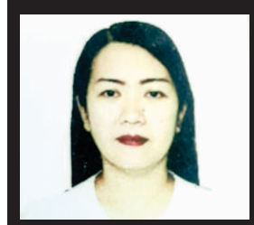
SA TOTOO LANG!