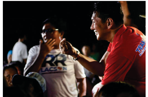
Connecting with the people: Former Mayor Emmanuel L. Maliksi.