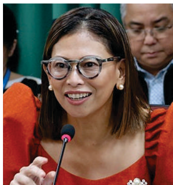
Marikina 2nd District Rep. Stella Quimbo