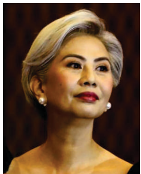
Mayor Honey Lacuna

Aniya pa: "Only the one releasing it can fabricate to his favor."