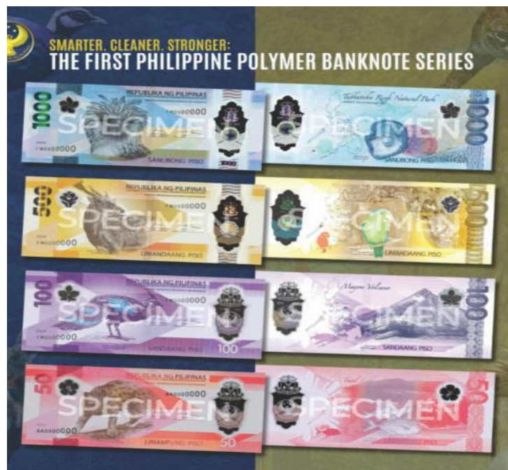
Bagong Php Peso Bill na inilabas ng BSP.

Para sa karagdagang impormasyon tungkol sa BSP Consumer Assistance Mechanism, bisitahin ang: https://bit.ly/BSPCAM