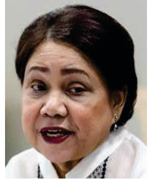
Sen. Cynthia A. Villar

Lola Cynthia as Senate President, why not! (taparaneliseo@gmail.com)