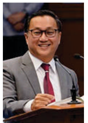
Sen. Francis Tolentino

karangalang SGLG ay ang makisig nating senador Francis 'Tol' Tolentino sa pangunguna ng ating Kuya Gov DILG Secretary Jonvic Remulla.