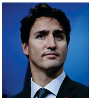
PM Justin Trudeau

Kasi, sinabi ni Trudeau na magtatakda siya ng mataas na taripa bilang sagot sa 25percent US tariffs -- na sabi ni Justin ay tiyak