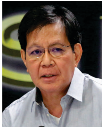
Former Sen. Ping Lacson

Hindi pumirma sa bicam committee report si Sen. Bong Go.