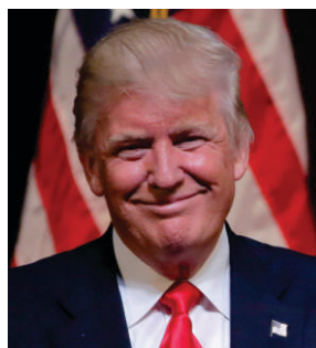
Pres. Donald Trump