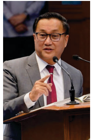
Sen. Francis Tolentino

Sabi ni Santos, only in the Philippine Senate lang daw makakikita ng isang senador na pumapatol sa mga pobrang security guards at ordinuonang manggagawa.