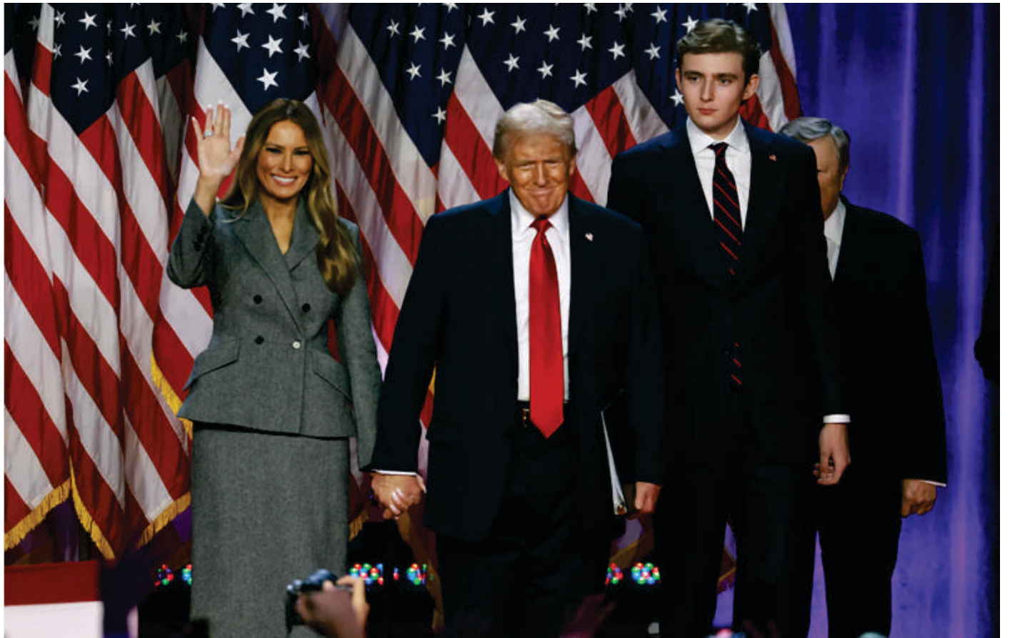
Congratulations! President-elect Donald Trump with former First Lady Melania Trump and son Barron Trump during an election night event on Nov. 6, 2024 in West Palm Beach Florida. Seventy-year-old Trump in his victory speech told the American people that he will bring peace back home. Read the full story, inside, page 2..