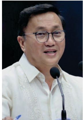
Sen. Francis Tolentino

See our frontpage news tungkol sa pahayag na ito ni president-elect Trump.