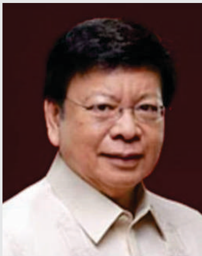
Rep. Rodante Marcoleta

Pinansin kasi ng kongresista ang inaakalang di-na-makatwirang pagbusisi kung paano ginastos ni VP Sara Duterte ang pondo ng Office of the Vice President (OVP) at ang Department of Education na pinamunujan noon ng bise-presidente.