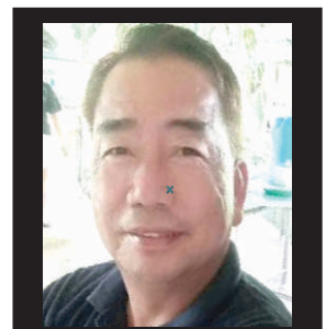
REVANZE ★ Domz B. CAOILE

Sa kabilang banda, magkaibigan sina dating Pres. Rodrigo Duterte at Trump at marami ang nagsasabi na malaki ang magiging papel niya para mabago ang political atmosphere sa Congress natin na