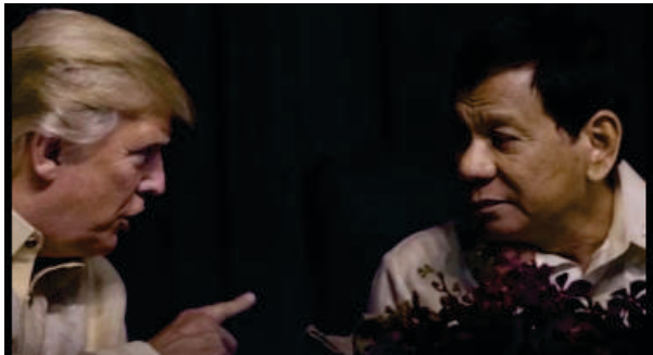
Sa lumang litrato na ito, nag-uusap si noon ay Pres. Donald Trump at nooy ay Pres. Rodrigo Duterte. Kinikilala ni Trump na kanyang BFF si Duterte.

Noong Setyembre, naging viral ang isang video na nakitang pinisil at pinilipit ni Villar ang kaliwang kamay ng isang di-nakilalang lalaki habang