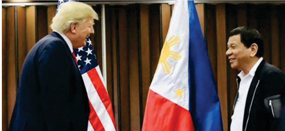
Prediksiyon: Malaking pagbabago sa US-Philippine foreign policy ang mangyayari sa pagbabalik ni Trump sa White House. Old photo of hen Pres. Duterte during the Trump visit to the Philippines in 2017.

Mabuti naman kung mangyayari ang pangakong ito ni Trump, at posible, mag-iba ang ihip ng hangin sa SCS dispute, at mamagitan si Trump sa China at PH na magkaroon ng bilateral talks at magkaroon ng kapayapaan sa pinag-aagawang teritoryo sa dagat na ang ating