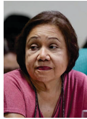
Sen. Cynthia Villar

Naging viral iyon sa social media at may isa pang insidente na