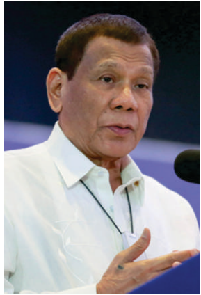
former President Rodrigo Duterte

Kailangang gawin ito, sabi ng kalihim upang mabigyang katarungan