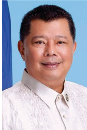
Sec. Boying Remulla

"If there are people who are willing to testify and give us evidence para mabuhay natin yung mga kaso kasi walang