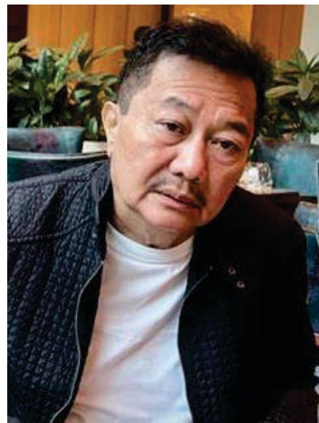
Rep. Pantaleon Alvarez

Kung ipipilit ng mga kongresista na usigin si Duterte, dapat ding humarap sa pag-uusig