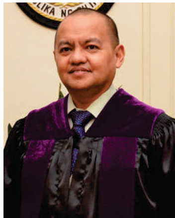
Senior Associate Justice Marvic M.V. F. Leonen