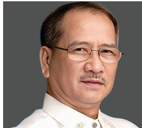
Mayoral candidate, Sir Vale Encabo