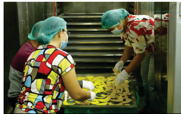
Trainees applying their learning on the production of dried squash inside the mobile food processing facility