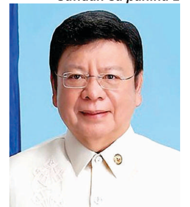
Rep. Rodante Marcoleta

Sa Cordillera Administrative Region, ang Sundan sa pahina 2