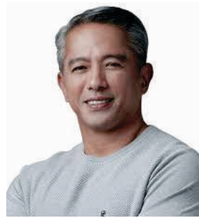
Gov. Jonvic Remulla donation would give barangay personnel greater mobility to serve well the city residents.

Mayor Ferrer thanked the governor for the