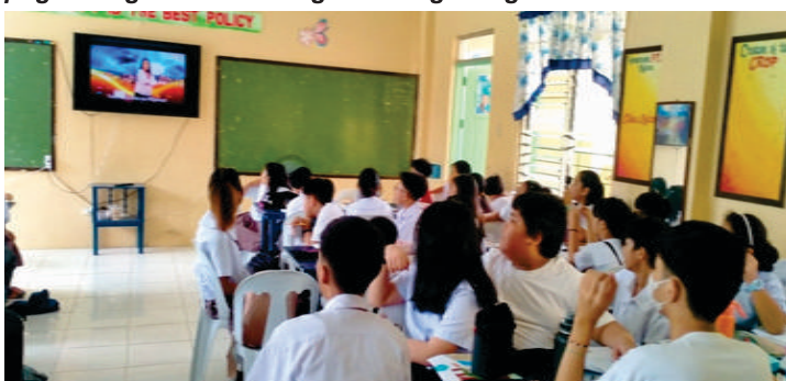
Sa ikalawang linggo ng pagdiriwang, tuwing ika-12 ng tanghali, nagpaparinig ang mga guro ng mga makabayang awitin sa kanilang mga mag-aaral.