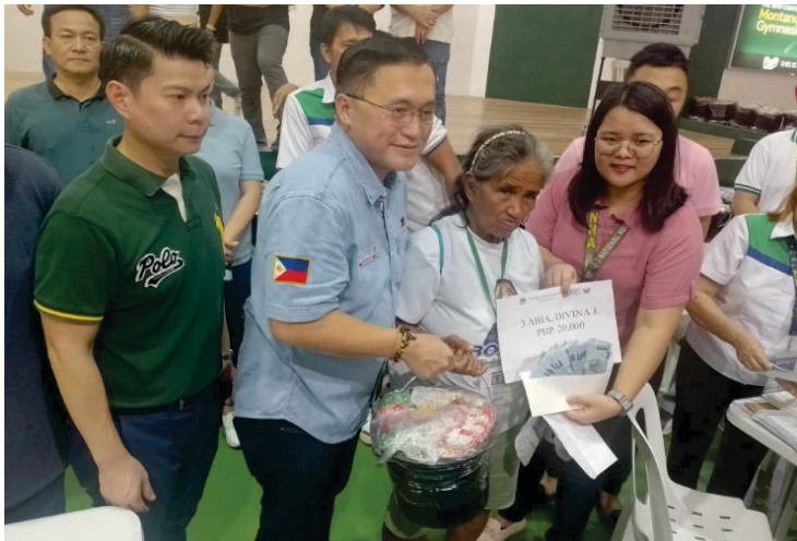
Katabi ni Mayor Denver Reyes Chua si Sen. Bong Go na masuyong inalalayan ang isang biktima ng sunog na tumanggap ng tulong pinansiyal.