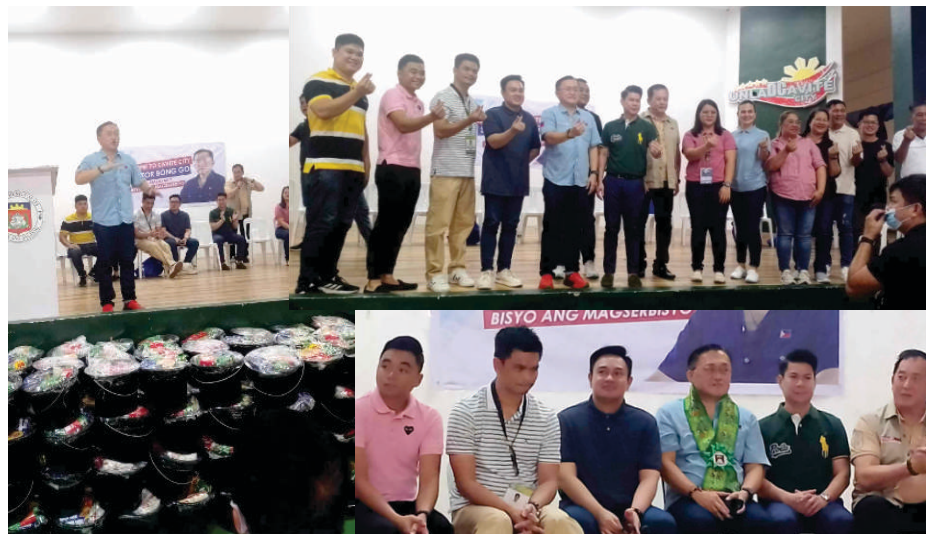
Sa pagpapakita ng pasasalamat sa naipamahaging tulong sa mga biktima ng sunog mula kay Sen. Bong Go, nagpakita ng thumbs-up sign ang mga opisyal ng Cavite City sa pangunguna ni Mayor Denver Reyes Chua.

Sen. Go is the principal author and sponsor of Republic Act (RA) 11463 of