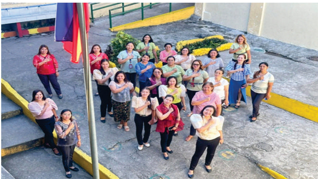
Sa larawan, nagpupugay ang mga guro sa pambansang watawat sa ginanap ng regular na pagtaas ng bandila tuwing Lunes ng umaga.