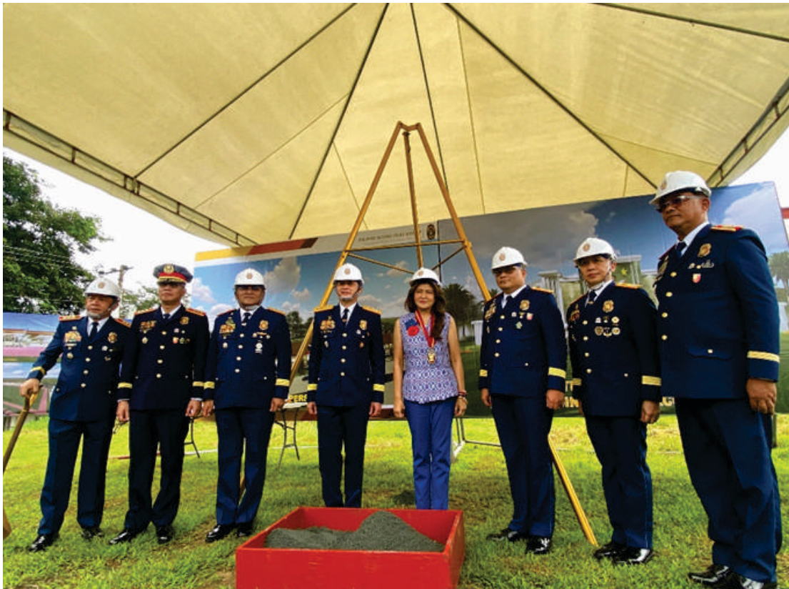
Senator Imee Marcos (4th from right) gladly poses for a photo ops with the Philippine National Police Academy (PNPA) at the groundbreaking ceremony of the new Marcos Field in Camp Gen. Mariano Castaneda, Silang, Cavite. Full story of Page 2