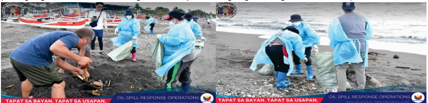
TAPAT SA BAYAN. TAPAT SA USAPAN. OIL SPILL RESPONSE OPERATIONS