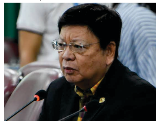
SAGIP Partylist Rep. Rodante Marcoleta

"Dapat dito may audit lahat yan. Ang nangyayari kasi sa ating COA [Commission on Audit], alam mo naman – post audit," giit ni Marcoleta.