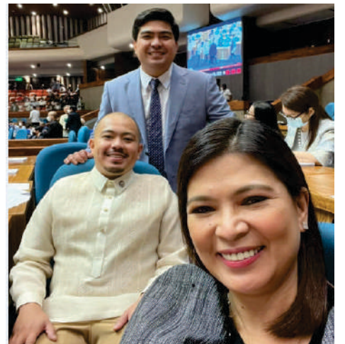
Representative Ate Lani Mercado-Revilla, Bryan Revilla and Jolo Revilla