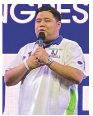
Rep. AJ Advincula

Kung may kailangang ilapit sa ating Imus City Congressman AJ Advincula, mayroon siya na bagong na mahihingan ng tulong ang mga kalungsod ko, ito ang Aksyon Center-Extension Office.