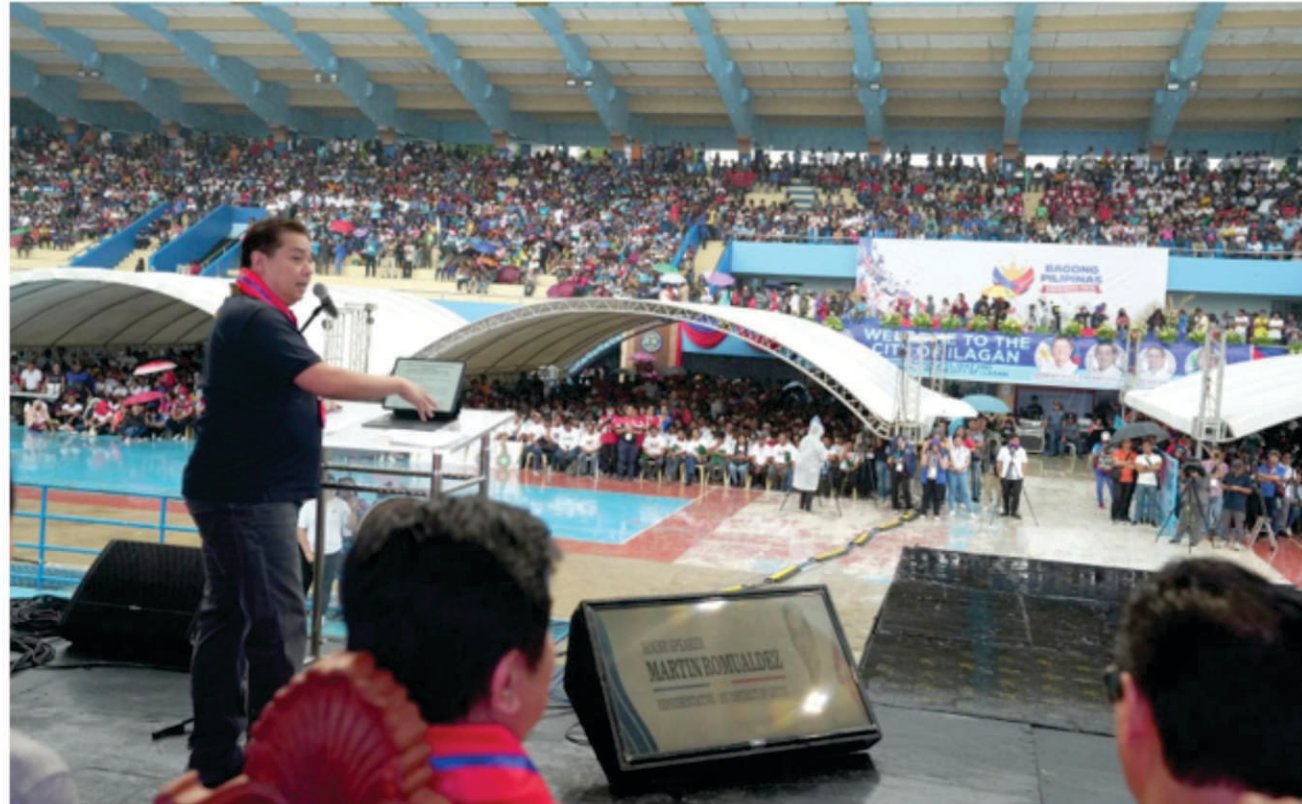
IN Photo: Speaker Ferdinand Martin G. Romualdez led the launch of Bagong Pilipinas Serbisyo Fair of President Ferdinand 'Bongbong' R. Marcos Jr. at the Isabela Sports Complex Saturday morning, Nov. 25, bringing a total of P500 million worth of programs and cash assistance to the people of Isabela.

About 36 national government agencies participated in the BPSF in Isabela and offered over 195 services for around 100,000 beneficiaries during the two-day festival.