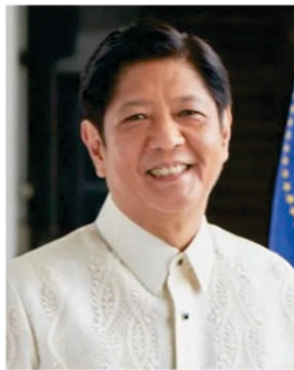
Pres. Ferdinand Marcos Jr.

This year's theme "Media's crucial role in encouraging agricultural, scientific and technological innovations in LGUs" aims to center on what science, technology and innovations can do to uplift the agricultural sector.