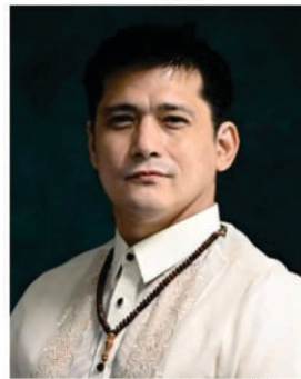
Senator Robin Padilla

This year's celebration will be in cooperation and coordination with the Department of Science