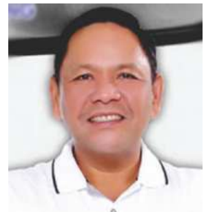
Acting Mayor Ted Carranza

Ayon sa OMB, sangkot ang magkapatid sa anomalya sa pagbili ng