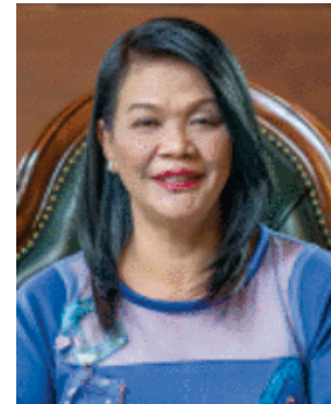
Mayor Dahlia Loyola

Carmona City Mayor Dra. Dahlia Loyola at 6th District (CarSIGMA) Rep. Roy Loyola ang ulat na "least polluted" ang hangin ng siyudad.