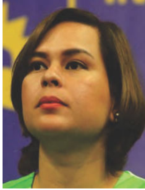
VP Sara Duterte

Nasaktan siya, sabi ni Mrs. Marcos nang umatend si Inday Sara sa rally kontra Charter Change na idinaos sa Davao City, kasabay sa paglulunsad ng Bagong Pilipinas campaign ng