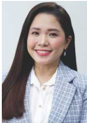
Mayor Gemma Lubigan

Kaya kamakailan, miniting niya ang mga opisyal ng Local Development Council (LDC) at City Project Monitoring Committee (CPMC) at tinalakay ang 2023 Accomplishment Report on the 20% Development Fund, pati ang 2024 Project Implementation Status under the 20% Development Fund.