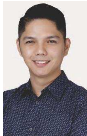
Mayor Kevin Anarna

page -- ang programa niyang scholarship, at inuumpisahan na ang pagtanggap ng aplikasyon.