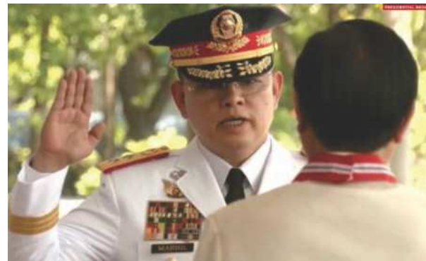
Si Gen. Rommel Marbil na itinalagang PNP Chief habang nanunumpa sa tungkulin sa harap ni Pres. Bongbong Marcos.

7. IPER ratings will be revised/reviewed based on performance. Tulad ng UPER, Individual Performance must be revised depending on what office are you assigned based on the mandate. Ito talaga importante ito para singilin ng tama ang mga opisyal na palamuti lang sa kanilang unit, lalong-lalo na'yung mga opisyal na kaya lang humawak ng opisina ay para magpa-promote at hindi upang tumulong at magtrabaho.