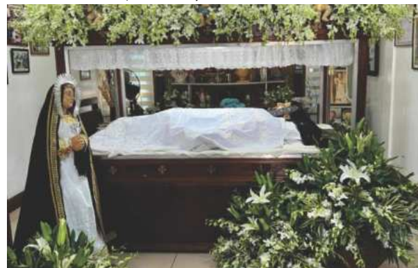
Mother watches over his dead son. These antique images owned by the Buenaventura family and the Montoya-Sayoc-Dominguez family, respectively, are reunited after 100 years.

historical, keeping these centuries old Lenten practices such as the "Pabasa ng Pasyon" (Reading of the Passion, a province-wide observance), "Penitensya" (Penance, in Ligton of Rosario town) and "Santo Entierro" (Holy Burial, also province-wide) alive until now.