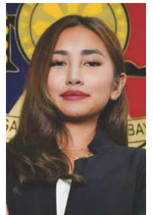
Vice Governor Athena Tolentino

barado o walang tigil na paglabas ng sipon; sinat o lagnat at masakit, malakas na pag-ubo at patuloy na pagbahin, pagluluha ng mga mata at minsan, pagsusuka, matapos ang matinding pag-ubo.