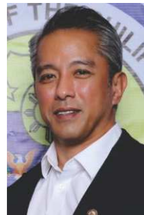
Governor Jonvic Remulla

Resolution, inaatasan ang pamahalaang panlalawigan na gamitin ang halagang of P40,000,000 para mabilis na magamot ang mga tinamaan ng pertussis at bumili ng tatlo (3) milyong bakuna -- na marahil, dumating na at marami na ang naiinkeiyonan laban sa nakamamatay na sakit na ito.