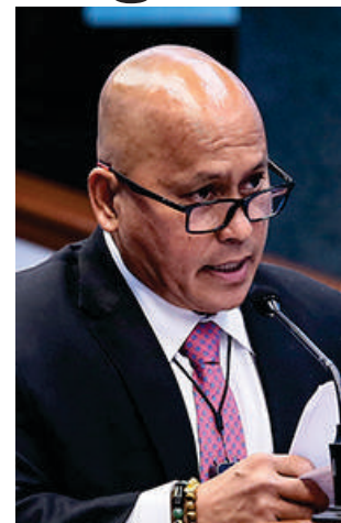
Sen. Ronald Dela Rosa