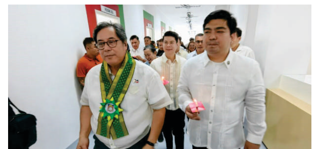
Magkasamang iniinspeksiyon nina DOH Sec. Teodoro Herbosa at Rep. Jolo Revilla ang mga kuwarto ng bagong ospital sa Cavite City.

the 100-bed mega health center in Sea Breeze, Barangay 28 in Cavite City started in 2022.