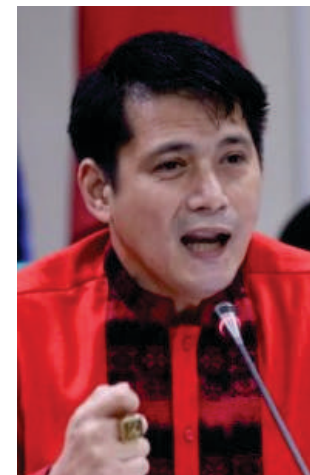
Sen. Robinhood Padilla

QUALIFIED patients may soon receive therapeutic and palliative benefits from medical cannabis or marijuana under Senator Robinhood Padilla's proposal while Sen. Ronald 'Bato' Dela Rosa said safeguards are already in place in the measures allowing the use of the plant.