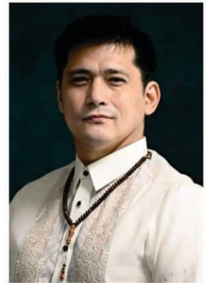
Sen. Robin Padilla

"Nakita ko ang kanilang lingap di lang ito sa Pilipinas kundi sa