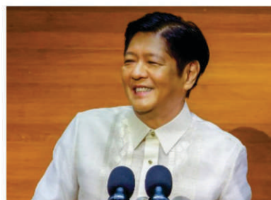
Pres. Bongbong Marcos