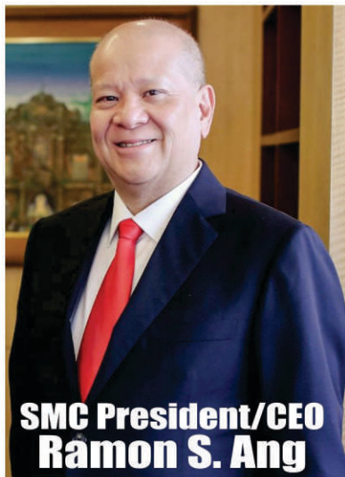
SMC President/CEO Ramon S. Ang