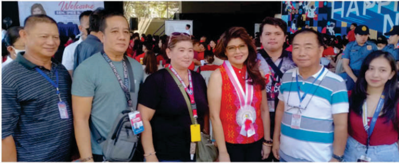
Mga aktibong kasapi ng Cavite Press Corps sa isang photo souvenir with Sen. Imee Marcos na nanguna sa pamamahagi ng ayudang pinansiyal sa mga benepisyaryo ng AICS sa Silang at Dasmaringas City.