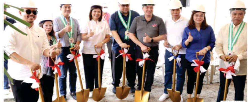
Kuha ang larawang ito noong Mayo 25, 2023, sa ginanap ang ground breaking ceremony sa pagtatayo ng Bacoor Cultural Center sa Barangay Daang Bukid.