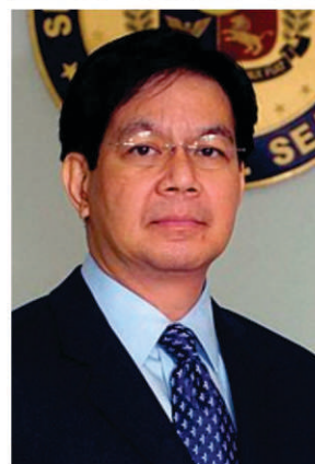
Dating Sen. Ping Lacson