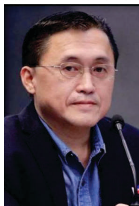
Sen. Bong Go

FORMER Senator Panfilo "Ping" Lacson wrote on X, Wednesday, Feb. 7 that whatever the haters of former President Rodrigo Duterte will say, "I do hope and pray that this will not end tragically."