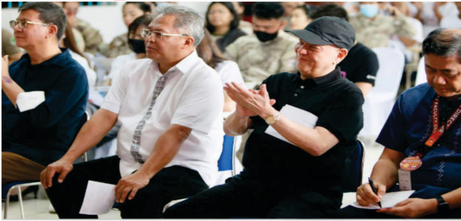
Sa larawan: Ikalawa, mula sa kanan, si SMC President, CEO Ramon S. Ang, kasama ang ilang opisyal ng BuCor.