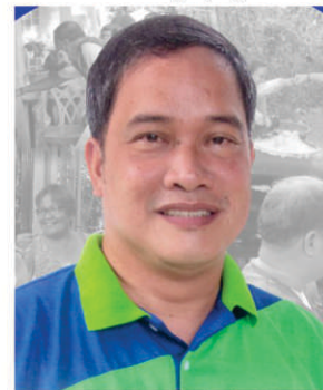
Mayor Umbe Arca