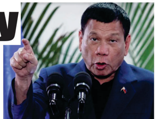
Dating Pres. Rodrigo Roa Duterte

In his vlog, ex-presidential spokesperson Harry Roque earlier revealed that Duterte told him about receiving information about his potential arrest in light of the ICC probe on the drug war-related