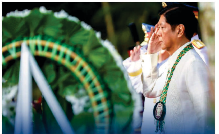
President Marcos leads the wreath-laying ceremony on the 9th death anniversary of the SAF 44.