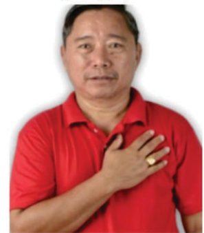
San Lorenzo Ruiz 2 Kap. Mor Asebias

mga pangangailangan ng kanilang tanggapan.