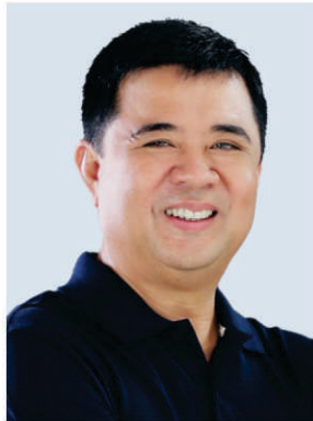
Mayor Alex Advincula Shop (BOSS) at the Imus Sports Complex at Barangay Poblacion and the new City Government Center.

Taxpayers may visit the Business One Stop