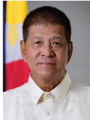
VM Homes Saquilayan These are open from 8 am, to 7 pm Mondays to Fridays, and 8 am to 4pm on Saturdays. /DBCaoile