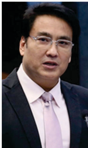
Sen. Bong Revilla

Malapit na kasi, pagpasok ng 2024, magpaparamdam na ang mga aspirants na