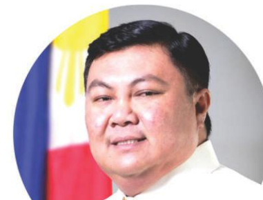
HON. SHERWIN L. COMIA Committee on Public Works and Infrastructures, Special Projects