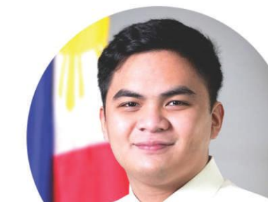
HON. ENZO GASTON A. FERRER Committee on Health, Nutrition, Population, and Sanitation; and Committee on Environment Protection and Ecology