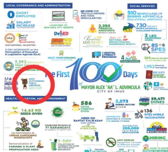
Collage of the major accomplishments of the AA administration on the first 100 days in office.

Inaatasan ang mga department heads na i-scan ang mga pampublikong dokumento at i-sumite ito sa city information office