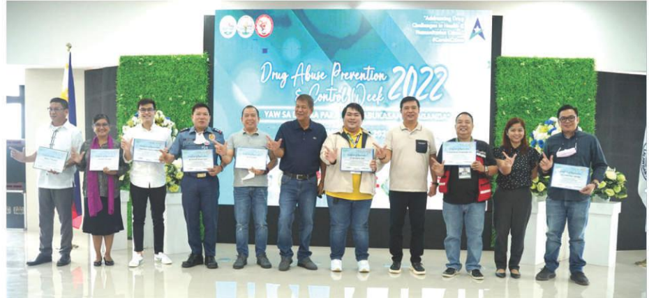
All-out anti-illegal drugs campaign launched.

In coordination and collaboration with the City's Sanggunian, the city government will invest in the professionalism and skills of Imuseno's workforce, and stimulate economic growth by engaging some of the the city's leaders in business, entrepreneurs, and other who wants to invest in Imus.