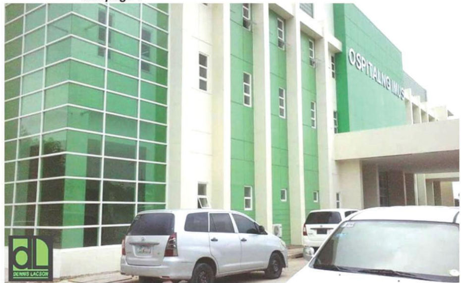
The first public hospital in the city: Ospital ng Imus (ONI) in Brgy. Malagasang !-G was established on the lot donated by the Advincula family to the city government.