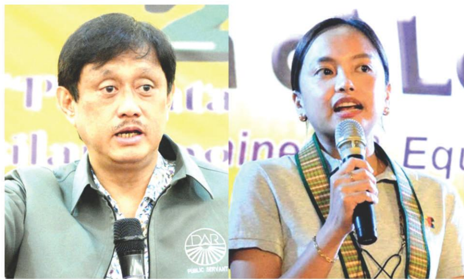
Bilisan na ang pamamahagi ng lupa: DAR Sec. Conrado Estrella III

Inuutos din na lutasin ang problema ng matutukoy na lupang