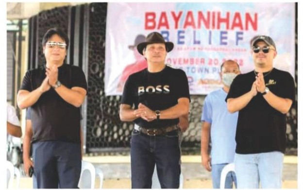
Laging handang tumulong: Mula sa kaliwa-- Sen. Bong Revilla, Naic Mayor Raffy Dualan, at Agimat partylist Rep. Bryan Revilla.