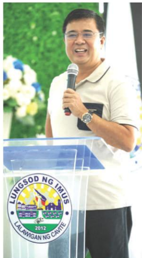
Handa kaming laging tumulong sa inyo. I have only one desire for our city -- to improve Imus for everyone's good future.