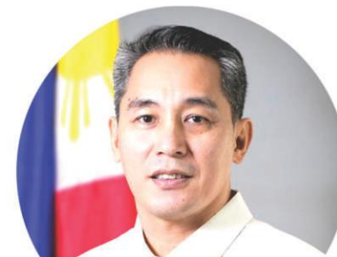
HON. DARWIN MARTI M. REMULLA Committee on Land Utilization, Zoning, and Housing; and Committee on Human Settlement