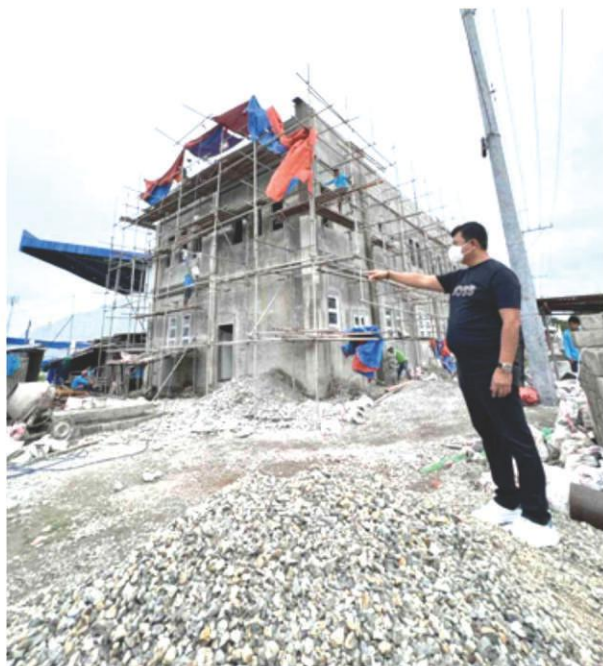
One of the ongoing infra projects of the city government.

many meetings had reiterated with the city government officials and personnel that tackling these challenges will require a comprehensive,