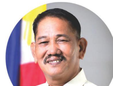
HON. EXEQUIEL B. ROPETA Committee on Agriculture and Livelihood and Agrarian Reforms