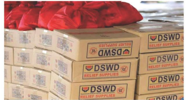
Mga paketeng naglalaman ng tulong mula sa Department of Social Welfare and Development (DSWD).