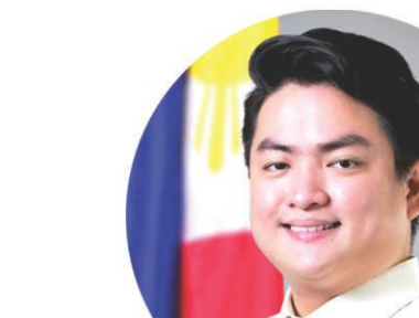
HON. GREGORIO MIGUEL B. OCAMPO JR. Committee on Education