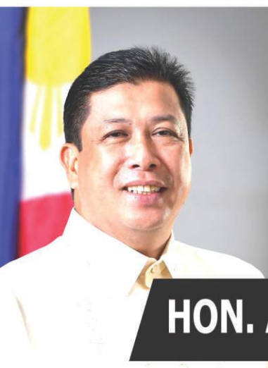
HON. ARNEL "ONY" M. CANTIMBUHAN