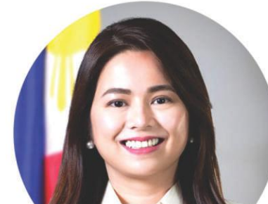
HON. JOGIE LYN L. MALIKSI Committee on Cooperatives and Culture, Tourism, Peoples, and Non-governmental Organizations' Accreditation