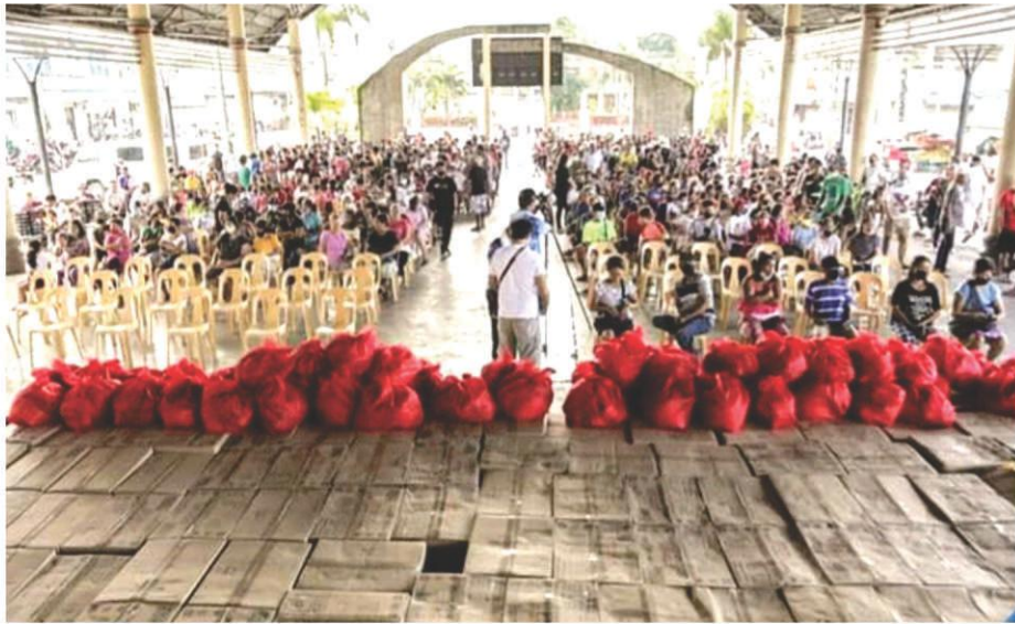
Maraming salamat po sa Bayanihang tulong sa Naicqueno.