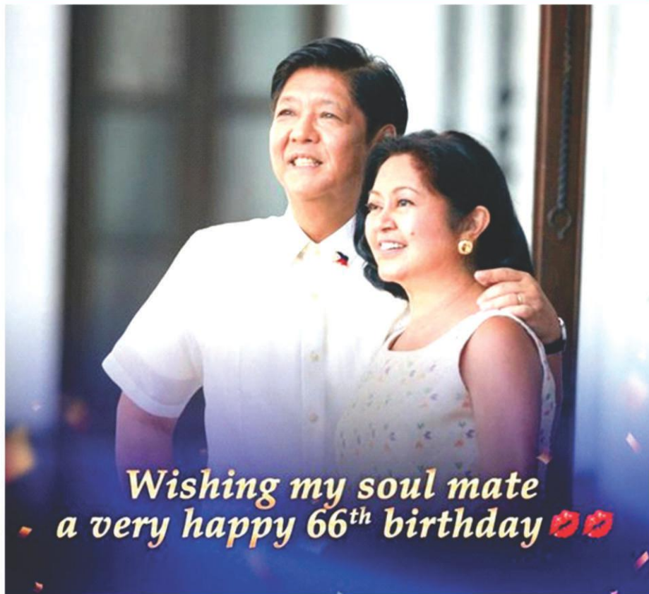
Wishing my soul mate a very happy 66 th birthday

FIRST Lady Liza honors 'soulmate' Bongbong on 66th birthday: How sweet, nakakilig ang matamis na pagbati ni Mrs. Marcos sa pagdiriwang ng ika-66 kaarawan ng kanyang mister nitong Miyerkoles, Setyembre 13, 2023.