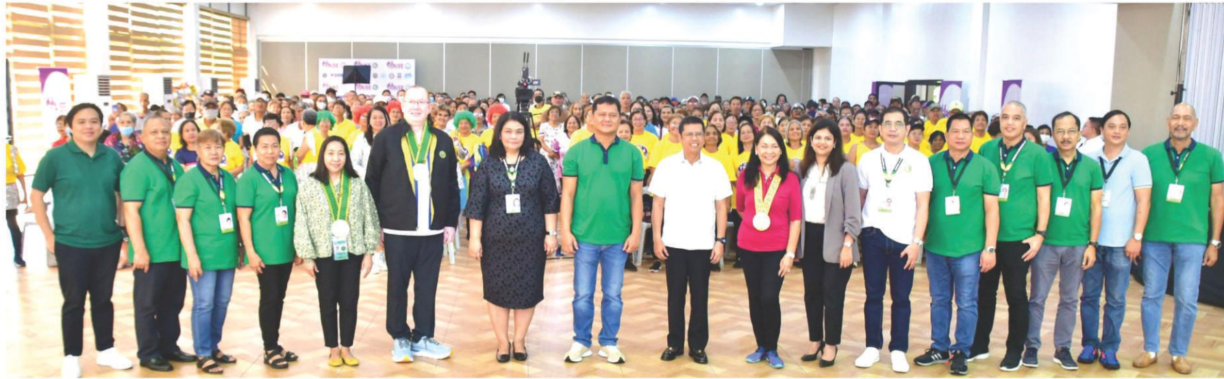
Kasama ang mga opisyal ng RAISE at si Dr. Eric Tayag, Health Undersecretary, at iba pang city health employees.