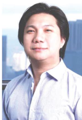
Mayor Dino Chua