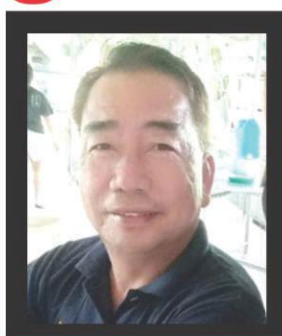
REVANZE by Domz B. CAOILE

Imbes na unang tulungan ang rice farmers upang makatipid sa mataas na produksyon mula sa