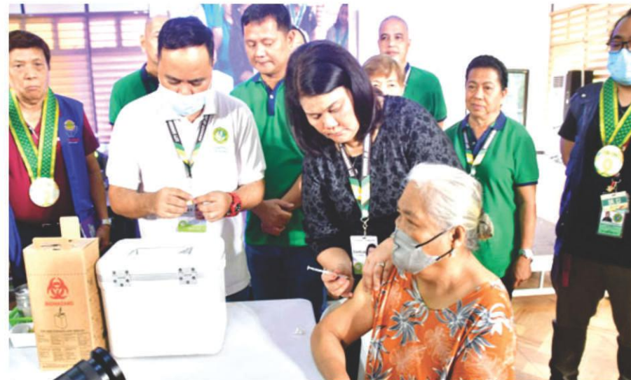
Iniiniksiyonan ni Dra. Mayor Dahlia Loyola ang isang lola ng anti-flu vaccine

"Kaya po ang health program ng mamamayan ang lagi nating priority at lagi nating sinusuportahan at tinatangkilik," sabi ni Mayor Loyola. /LIZA FE BONETE