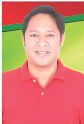
Mayor Voltaire Ricafrente