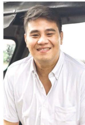
Mayor Angelo Aguinaldo