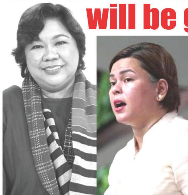
Sec. Susan Ople