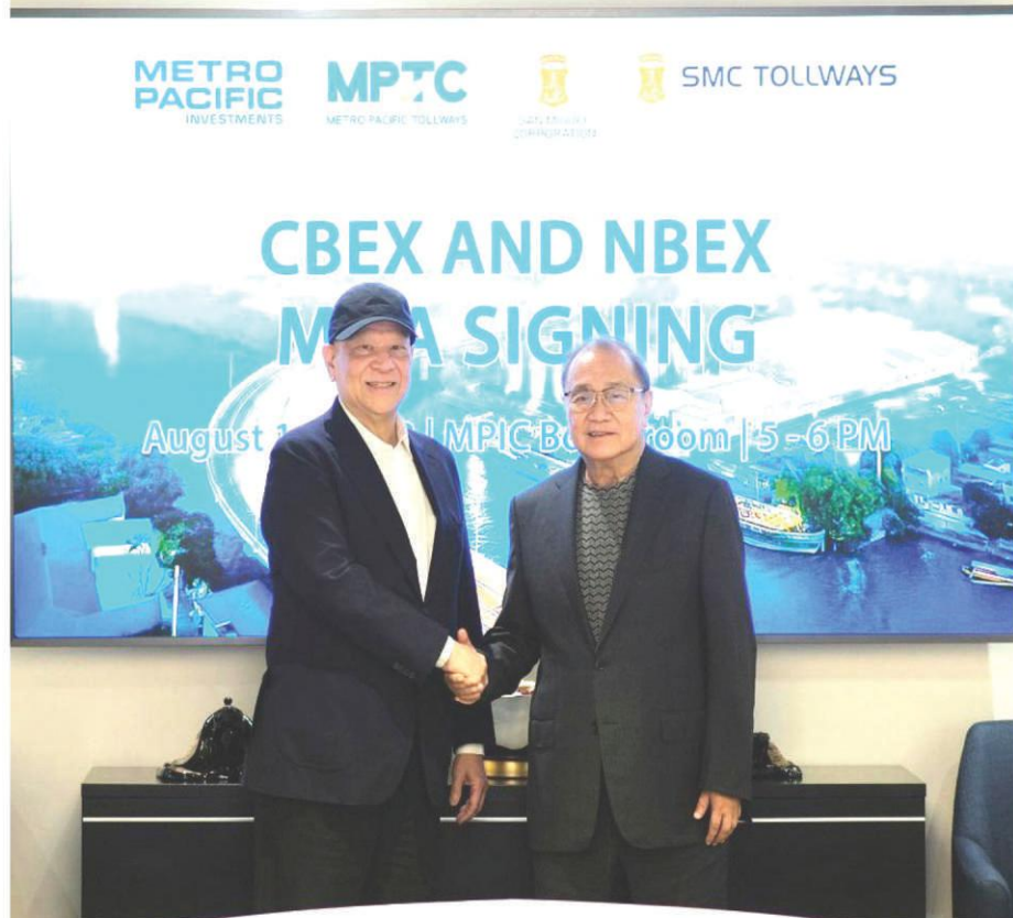
MPIC chairman Manuel V. Pangilinan and SMC CEO Ramon Ang sign an agreement to jointly undertake CBEX and NBEX projects.

The joint endeavor encompasses a 27.06-kilometer CBEX segment linking CALAX's Silang (Aguinaldo) Interchange to Nasugbu, Batangas, and a 60.90-kilometer NBEX section enabling seamless connectivity from Nasugbu to Bauan, Batangas.