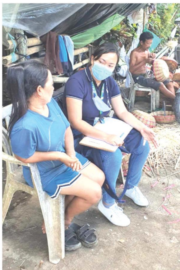
Staff of the project titled "Enhancing the Growth of Bamboo-based Enterprises in Laguna" conducts in-depth interviews of firms engaged in the bamboo business.