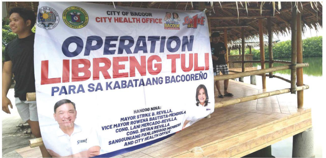
HAPPY ang mga nagbibinata sa matagumpay na Operation Tuli na isa sa magandang proyekto ng pamahalaang lungsod ng Bacoor -- sa pangunguna ni City Mayor Strike Revilla at ni Vice Mayor Rowena Bautista-Mendiola. Katuwang sa proyekto ang SNTKI at mga opisyal ng barangay at mga konsehal ng siyudad.