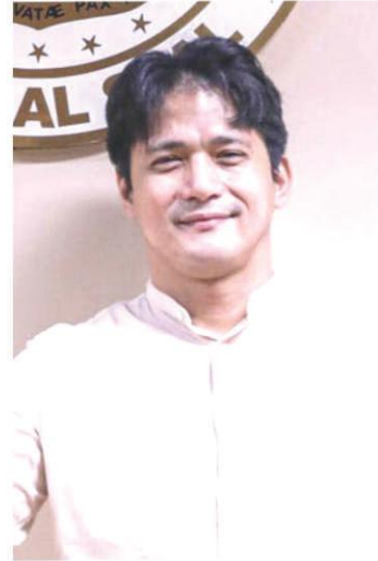
Sen. Robin Padilla

Sabi pa ni Pimentel: "President Marcos has shown his resolve and unwavering dedication to help our