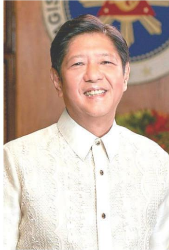
President Marcos Jr.

Dalawa sa kondenado ay nahaharap sa kasong bitay, ayon