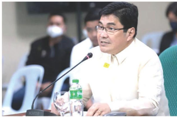
Dating DSWD Sec. Erwin T. Tulfo

inomina ang tao na nais nila na ipresenta sila sa Kongreso -- at ito ay nasa batas, nasa Konstitusyon na hindi pwedeng salungatin at labagin.