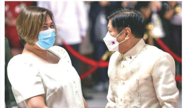
VP Inday Sara at PBBM: best friend forever