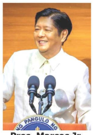
Pres. Marcos Jr.