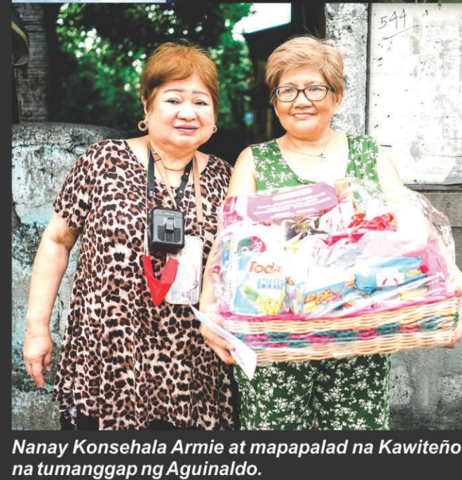
Nanay Konsehala Armie at mapapalad na Kawiteños na tumanggap ng Aguinaldo.