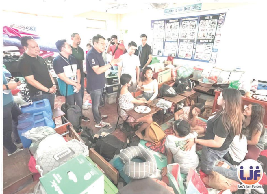
Ayuda sa Quadra fire victims, Mayor JonJon at Cavite City Mayor Denver Reyes Chua.