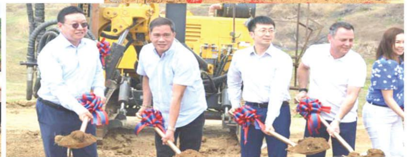
Cheez: Hawak ang pala, nakangiting nagpakuha ang mga opisyal ng Batangas at Cavite bago simulan ang seremonyas na hudyat ng paglalagay ng time capsule sa itatayong Solar Power Plant.