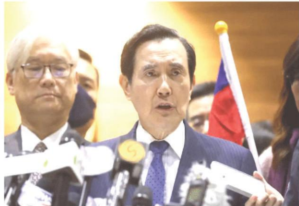
Dating Taiwan President Ma Ying-jeou

Habang nasa China si Ma, bumisita naman sa US si Taiwan President Tsai Ing-wen at nakipagmiting