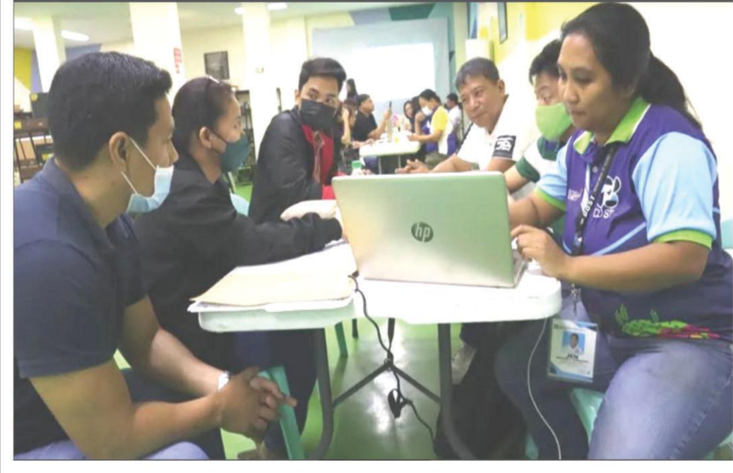
SKPF/PPESO - MEGA JOB FAIR CARAVAN APRIL 12, 2023 | NAIC, CAVITE WWW.CAVITE.GOV.PH - WWW.JONVICREMULLA.COM