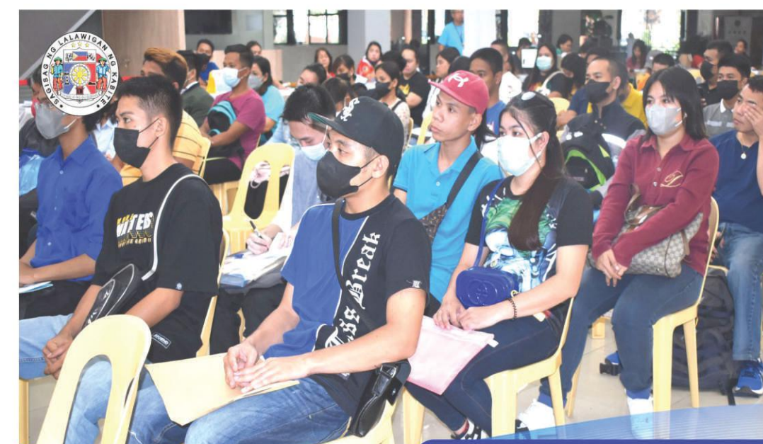
TAPAT SA BAYAN. TAPAT SA USAPAN.

Maraming trabaho sa mga lokal na kompanya ang inialok ng mga kompanyang lumahok sa proyekto na inorganisa ng Sangguniang Kabataan Provincial Federation (SKPF), katuwang ang Provincial Public Employment Service Office (PPESO).