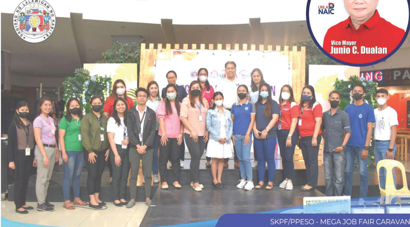
SKPF/PPESO - MEGA JOB FAIR CARAVAN APRIL 12, 2023 | NAIC, CAVITE WWW.CAVITE.GOV.PH - WWW.JONVICREMULLA.COM