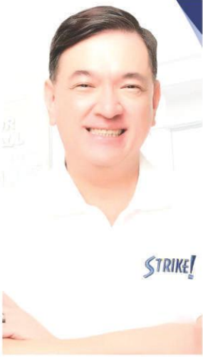
Mayor Strike REVILLA