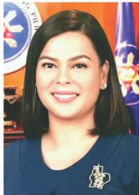
VP Sara DUTERTE

Marcos is followed by Senate President Juan Miguel F. Zubiri with 48 percent, and House Speaker Martin G. Romualdez with 44