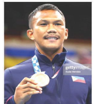
Boxing Gold Medalist Eumir Felix Marcial