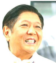
President MARCOS Jr.

PULSE Asia in its reports released to media, Wednesday April 12 showed that Vice President Inday Sara Z. Duterte is the most trusted government official in the Philippines.