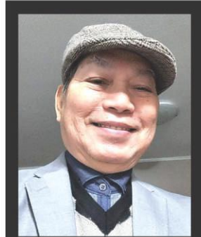
Here n There

Sabi pa ng SC: "In this case, there is no anchor apart from the auditory