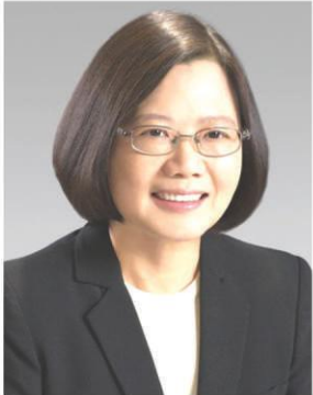
Taiwan President Tsai Ing-wen