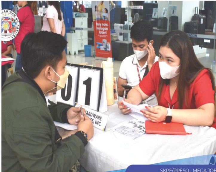
SKPF/PPESO - MEGA JOB FAIR CARAVAN APRIL 12, 2023 | NAIC, CAVITE WWW.CAVITE.GOV.PH - WWW.JONVICREMULLA.COM