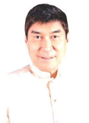
Senator Raffy TULFO

At sinabi Niya, kung saan naroon ang dalawa o tatlo taon na