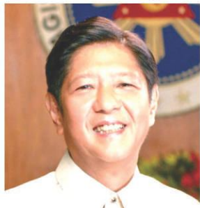
President MARCOS Jr.

Naipaliwanag na rin, sabi ng Pangulo sa mga lokal na opisyal na mahalagang mapagtayuan ng EDCA sites dahil makabubuti sa kani-