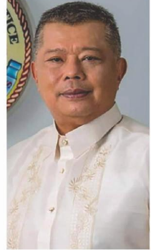
Sundan sa p.2 SEC. BOYING REMULLA