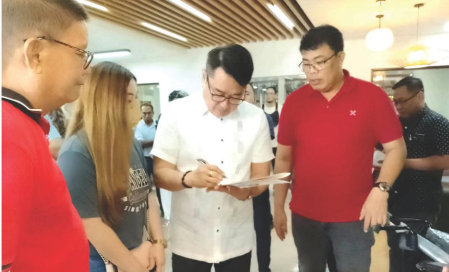
What a busy day for Mayor Jonjon Ferrer: meet up with some of her constituents and listening and offering solutions to their concerns; signing important documents to implement better services to the GenTriseños.