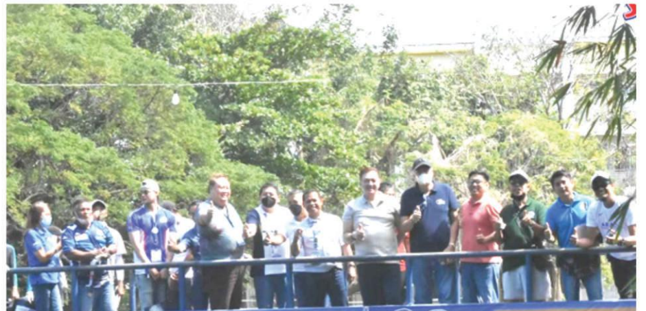
Let's support this project. This is an ON of the Govern