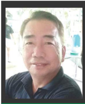
REVANZE