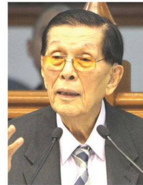
Juan Ponce ENRILE

Official government data on the casualties of the