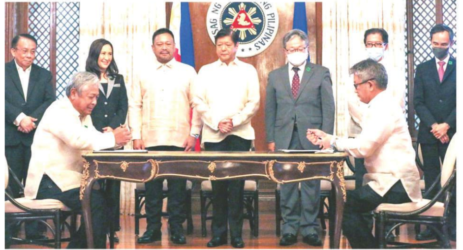
SUBWAY project President Ferdinand Marcos Jr. looks on during the contract signing of the construction of the Metro Manila Subway Project's Quezon Avenue and East Avenue stations as well as the Anonas and Camp Aguinaldo's stations.

The high-impact projects approved by the NEDA Board, chaired by President Ferdinand R. Marcos Jr., include the establishment of a 300-