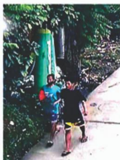
09:24:08 AM AGUINALDO HI-WAY IN FRONT OF NISSAN

SA MAKAKAPAGBIGAY NG PANGALAN AT TIRAHAN NG DALAWANG TAO NA NAGNAKAW NG KAWAD NG KURYENTE.