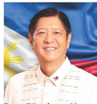
Pres. Bongbong Marcos