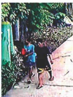
09:25:03 AM AGUINALDO HI-WAY IN FRONT OF SWISS RESORT