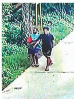
09:24:29 AM AGUINALDO HI-WAY IN FRONT OF FLIP AND BEYOND RESTO BAR