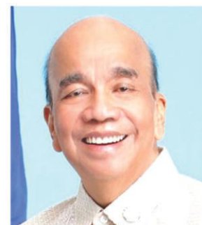
Rep. Pidi BARZAGA

To see the screenshots, interested informants could visit the