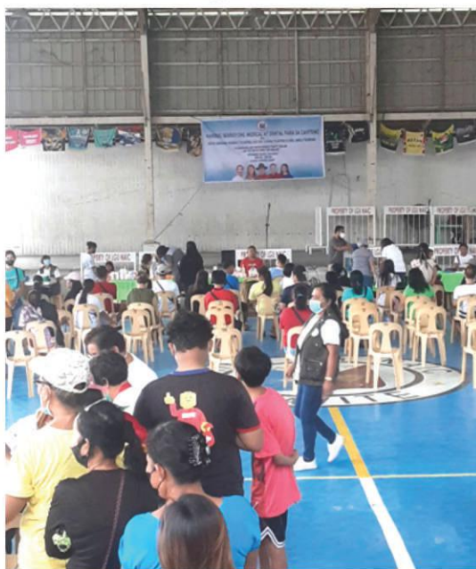
The Serbisyong Handog sa Cavitenos was held Nov. 19 at Naic municipal covered court.