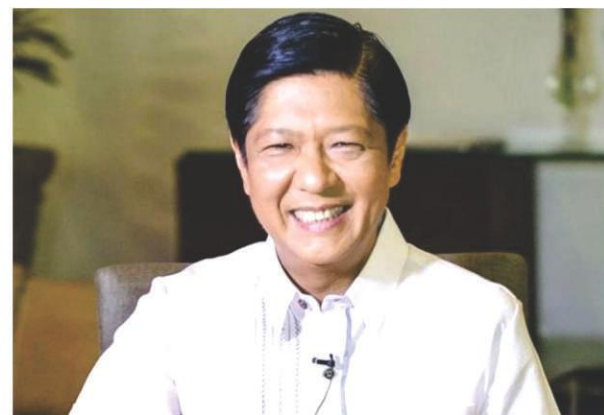
PBBM: nababahala sa posibleng pagtaas uli ng singil sa elektrisidad