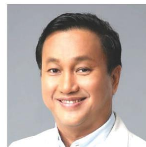
Senator Francis TOLENTINO

Milyones ang sahod ng mga executives ng SSS, GSIS, mga bangko ng gobyerno na nag-i-invest na sa mga negosyo, ilantad muna kung kumikita ba at magkano na ang kinikita,