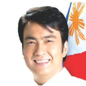
Senator Bong REVILLA

May nagsasabi na tamang ilagay sa negosyo, i-invest ang pera ng SSS at GSIS at ng bangko ng gobyerno para kumita at hindi ang mga oligarko na lamang ang nagpapasasa sa pera tinutubo mula sa