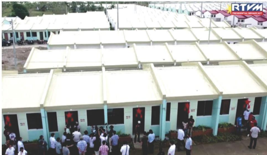
Babayaran sa mahigit na 30 taon, pormal na ibinigay ang certificate of lot awards (CELAs) sa mapapalad na benepisyaryo ng murang pabahay na programa ng National Housing Authority (NHA) sa Barangay Calubcob, Naic, Cavite, Lunes, Disyembre 5, 2022.

"Kami naman po ay mabigyan sana, kami man ay nangangarap ding magkaroon ng sariling bahay, Pangulong Bongbong Marcos," sabi ng ayaw magpakilalang guro ng isang public elementary school sa Naic.