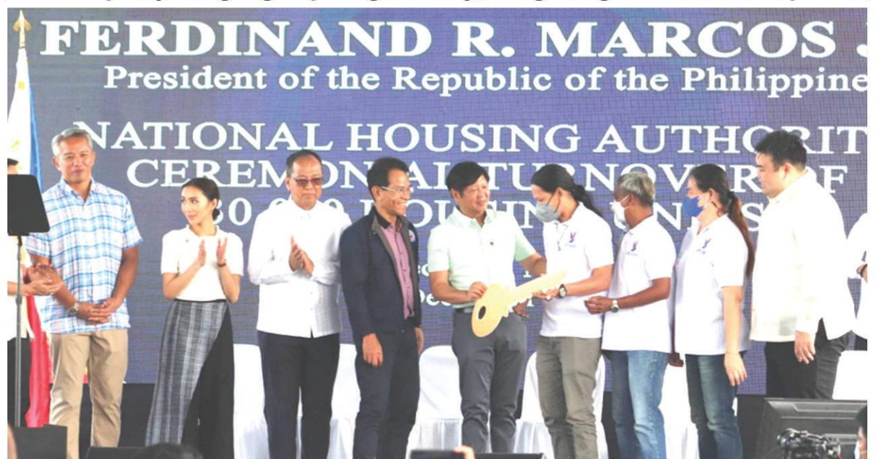
Nakangiti si Presidente Bongbong Marcos habang iniaabot ang malaking susi na simbolo ng pagmamay-ari sa isang benepisyaryo ng murang pabahay ng NHA sa okasyong ginanap, Lunes, Dis. 5, sa Barangay Calubcob, Naic.

Kami rin po ay nangangarap magkabahay, Pangulong Marcos -- Naicuenos