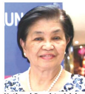
National Security Adviser Prof. Clarita Carlos